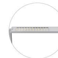
Integrated die-cast and 23mm ultra-thin lamp head, good heat dissipation performance