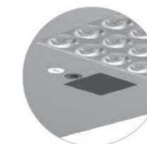
Daylight sensor & Presence sensor